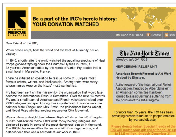
The IRC website does a good job of showcasing their history.